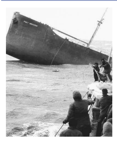
Coast Guard crewmen from the YAKUTAT pulling in the last two survivors in a rubber boat from the bow section of the FORT MERCER. The tanker sank into the chilly waters 20 minutes later.

After the sickening split on the FORT MERCER, nine crewmembers were trapped on the bow section which was partially submerged. Five of them met their fates, but four others, including the Captain, found salvation after another staggering Coast Guard rescue mission. 34 men remained on the stern which was floating free. M.E.B.A. Chief Engineer Jesse Bushnell took control and rallied the stricken crew. The engineers were able to maintain control and narrowly avoided a collision with the bow section as the relentless sea did them no favors. The Coast Guard again mounted a rescue mission and 21 shivering and grateful mariners were offloaded to the three cutters on scene - the Eastwind, the Acushnet, and the Yakutat. But 13 men chose to stay with the stern including the M.E.B.A. officers. The stern half of the vessel floated free and drifted southwestward for several days. The New York Times reported that, "The 'stay-putters' had light and heat because the boilers and almost all the ship's machinery were in that section. There was plenty of food in the galley." The broken stern half of the ship drifted 40 miles away from the bow and eventually hooked up with a pair of salvage tugs which took it in tow to Newport, R.I. Chief Bushnell said, "It was the worst storm I have ever experienced. I am sure any ship would have broken in two in such freakish weather."