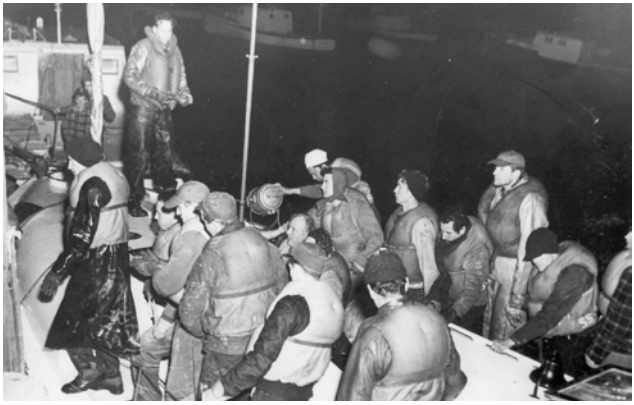
Survivors from the PENDLETON's stern section at the end of their ordeal getting ready to go ashore. (Photo courtesy of USCG).

The bow of the PENDLETON was sold for scrap. But while being towed, a section of the ship got snagged and tore away on the Pollock Rip Shoals near Chatham, Massachusetts where it rests today. The stern of the ship lies twisted and scattered near Chatham, 1 mile east of Monomoy Island. It remains a popular dive spot. Soon after the incident, the FORT MERCER's bow was blasted into a watery grave by Coast Guard guns after determining it was a hazard to navigation. The ship's owners later attached a new bow to the stern section of the MERCER and the vessel was rechristened as the SAN JACINTO. That ship continued the MERCER curse when an explosion a dozen years later blew the vessel in half off the east coast of Virginia. The remains of that ship were then crafted into two new vessels - the SEATRAIN MARYLAND and the PASADENA – ships that continued operation without the drama or frightful ordeals endured by their predecessors.