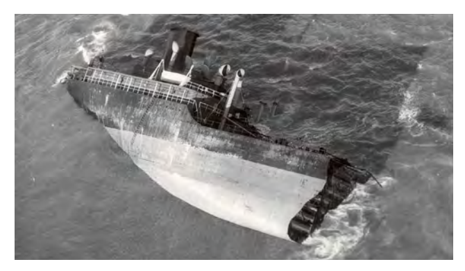
The stern of the PENDLETON beached on a sandbar where a Coast Guard rescue effort was able to recover 31 of 32 crewmembers on that half of the ship.

The bow of the PENDLETON was sold for scrap. But while being towed, a section of the ship got snagged and tore away on the Pollock Rip Shoals near Chatham, Massachusetts where it rests today. The stern of the ship lies twisted and scattered near Chatham, 1 mile east of Monomoy Island. It remains a popular dive spot. Soon after the incident, the FORT MERCER's bow was blasted into a watery grave by Coast Guard guns after determining it was a hazard to navigation. The ship's owners later attached a new bow to the stern section of the MERCER and the vessel was rechristened as the SAN JACINTO. That ship continued the MERCER curse when an explosion a dozen years later blew the vessel in half off the east coast of Virginia. The remains of that ship were then crafted into two new vessels - the SEATRAIN MARYLAND and the PASADENA – ships that continued operation without the drama or frightful ordeals endured by their predecessors.