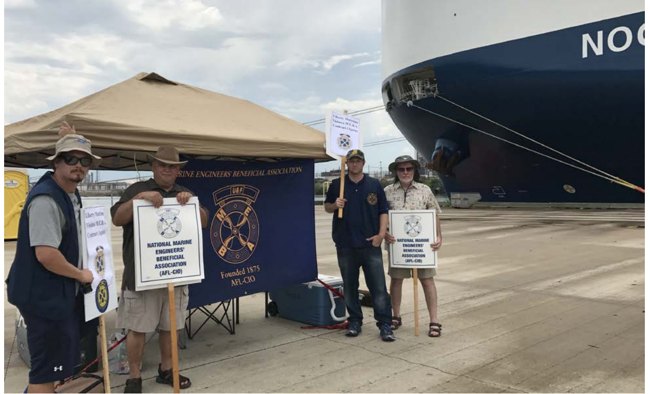
Members set up shop by the soon-to-be LIBERTY PEACE in the Port of Beaumont. It was sunny and warm at first, but by Thursday conditions worsened n advance of Hurricane Harvey.

Again, the M.E.B.A. is <u>NOT</u> on strike against and DOES NOT have a labor dispute with any other employer. The Union is <u>NOT</u> seeking to interfere with the business operations of any entity or induce employees of other employers to cease work or refuse to make deliveries.