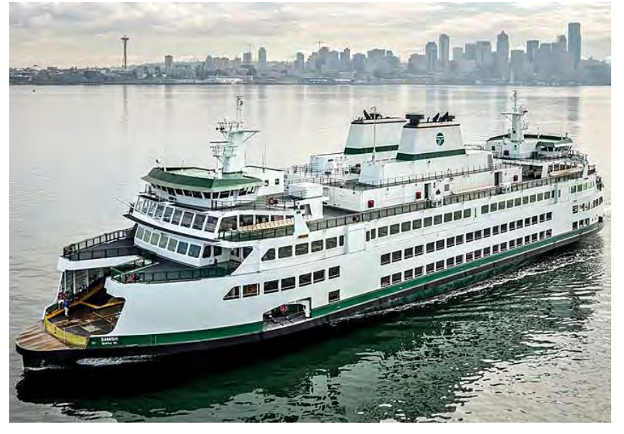
Washington State Ferries recently took delivery of its latest vessel, the M/V SAMISH. The Olympic-class ferry can carry 1,500 passengers and 144 cars and was put on the Anacortes to San Juan Island run. This is the second of three newbuilds commissioned to replace the fleet's 1950s-era diesel-electric Evergreen State ferries.