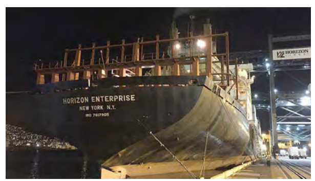
The HORIZON ENTERPRISE is now part of Pasha and continues its service between the West Coast and Hawaii. There was no loss of M.E.B.A. jobs following the completion of the complex two-part acquisition of Horizon Lines.