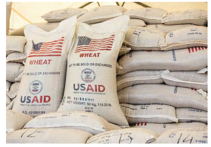
Food Aid reform proponents should be mindful to proceed without compromising U.S. sealift capabilities. Under the Corker plan, more U.S. dollars would go to foreign farmers to purchase food for third world nations leaving a rift for U.S. farmers and American mariners.

The U.S. Merchant Marine has long likened the series of programs that help keep it stabilized to a three-legged stool - the Jones Act, Maritime Security Program and cargo preference laws. Military cargo accounts for about 80% of preference cargo. But U.S.-shipping is already suffering from diminishing cargoes following DOD's drawdown of peacetime forces overseas. The lion's share of the other 20% of preference cargo is primarily accounted for through the Food Aid program and cargoes from the Export-Import Bank. The Ex-Im Bank is also under attack, and at press time, Congress was considering whether to renew the Bank's charter. A loss of Food Aid cargo with no replacement plan would further hasten the spiral of vanishing U.S.-flag vessels and the associated pool of U.S. mariners. It would also