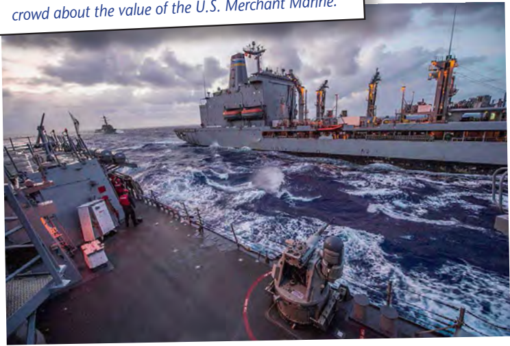
The M.E.B.A.-crewed MSC fleet replenishment oiler USNS PECOS participating in an exercise during Multi-Sail 2015. The Navy Pacific Fleet exercise is designed to assess combat systems, improve teamwork and increase warfighting capabilities. The guided-missile destroyers USS FITZGERALD and USS LASSEN can also be seen in this shot with the PECOS.