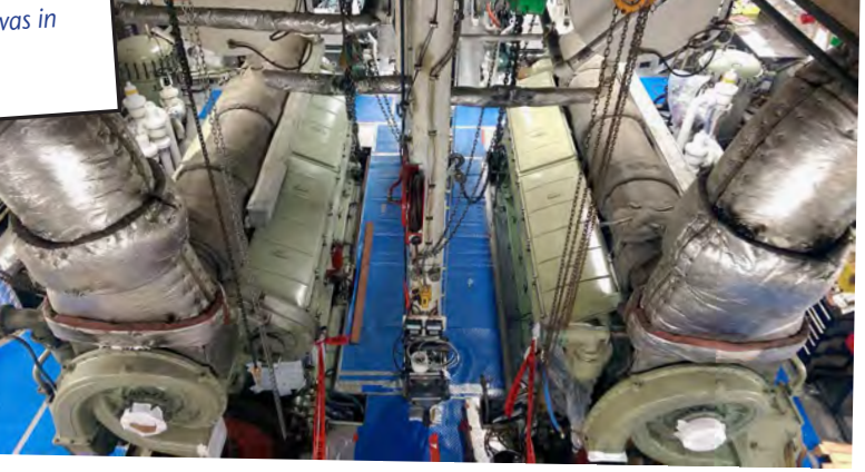
The Washington State Ferry MV KALEETAN in Seattle's Vigor Shipyard getting ready for a propulsion generator rebuild.