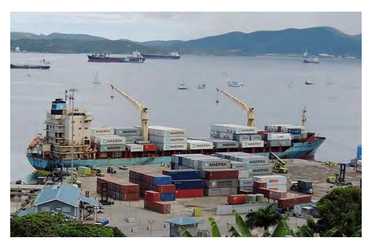
The Maritime Security Program vessel MAERSK ALABAMA in Papua New Guinea. The vessel was famously carrying Food Aid cargo in April 2009 when Somali pirates attempted a hijacking before being thwarted by a crafty Chief Engineer and other ALABAMA crewmembers.

There's a good reason for that. In a statement submitted for the record, U.S. maritime interests acknowledged that they can appreciate the desire to fine-tune the Food Aid program, but pointed out any forwarded proposal must ensure that U.S. maritime jobs, U.S.-flag ships and logistical networks available through the Maritime Security Program are not threatened. A number of shipping companies, associations and maritime labor unions, including the M.E.B.A. and AMC, crafted and signed onto the statement. Unfortunately the Corker/Coons