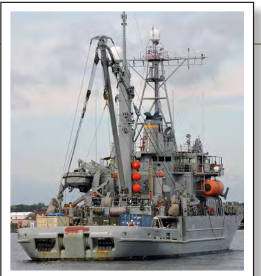
The M.E.B.A.-crewed USNS GRASP is supporting U.S. Naval forces operating in the U.S. 6th Fleet area of responsibility. The Military Sealift Command rescue and salvage ship, crewed by M.E.B.A., MM&P and SIU, is conducting dive and salvage operations as well as training with partners and allies.