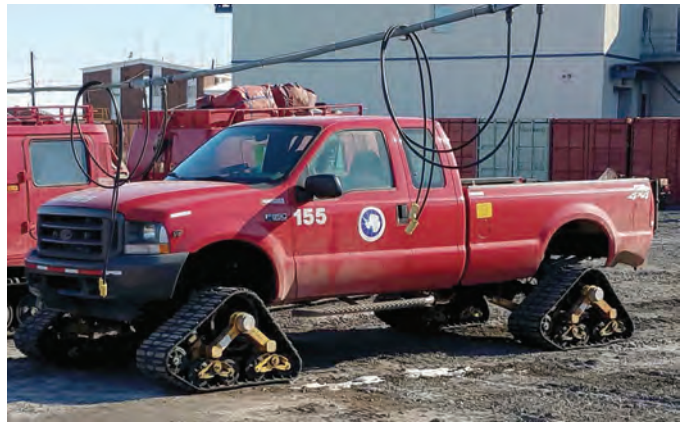
A Ford F-350 modified for the terrain at McMurdo.

The M.E.B.A. Chief Engineer pointed out that, "some of our crewmembers were able to watch the Super Bowl live at McMurdo Station, but for us, instead of Super Bowl Sunday, it was Super Bowl Monday because McMurdo is 18 hours ahead of the US East Coast."