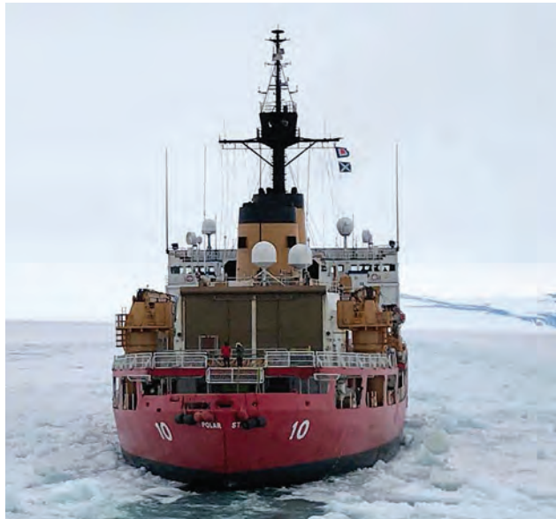
The Coast Guard’s heavy icebreaker POLAR STAR broke up solid ice on the way to McMurdo Sound. The ship’s crew overcame numerous challenges posed by the 43-year old vessel.

On its way home on February 10, the crew of the POLAR STAR spent nearly two hours extinguishing a fire in the ship’s incinerator room 650-nautical-miles north of McMurdo Sound. The fire damaged the incinerator, and the water used to fight the fire took a toll on some of the electrical wiring. Fortunately there were no injuries. Incinerator repairs were added to the checklist for the POLAR STAR’s already-scheduled in-port maintenance period which could last awhile.