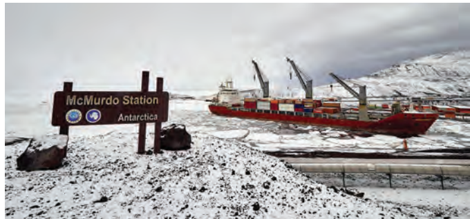
The OCEAN GIANT at McMurdo's ice pier.