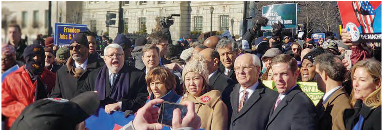
M.E.B.A. showed solidarity with government workers in D.C. at a labor rally outside AFL-CIO Headquarters in January as they demanded the end of the partial shutdown. The rally evolved into a march on the White House a few blocks away in an effort to make lawmakers understand that workers don't want to be pawns in their political game.

months (180 days) of employment, i.e., actual vacation wages will not be paid, and credit will not be given for Pension Plan, Medical Plan and Training Plan purposes. When filing for vacation, you need to make note of your return to work date. (M.E.B.A. Vacation Plan Rules & Regulations, Paragraph 10 – see M.E.B.A. Plans website www.mebaplans.org ). To ensure the Vacation Plan regulations are adhered to when dispatching jobs and to prevent issues and/or penalties with M.E.B.A. Plans, the Union requires a return to work date when clearing for a vessel.