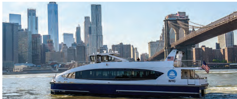
M.E.B.A. won the right to represent Captains on the expanding NYC Ferry fleet. The Union is looking to work out a first contract.