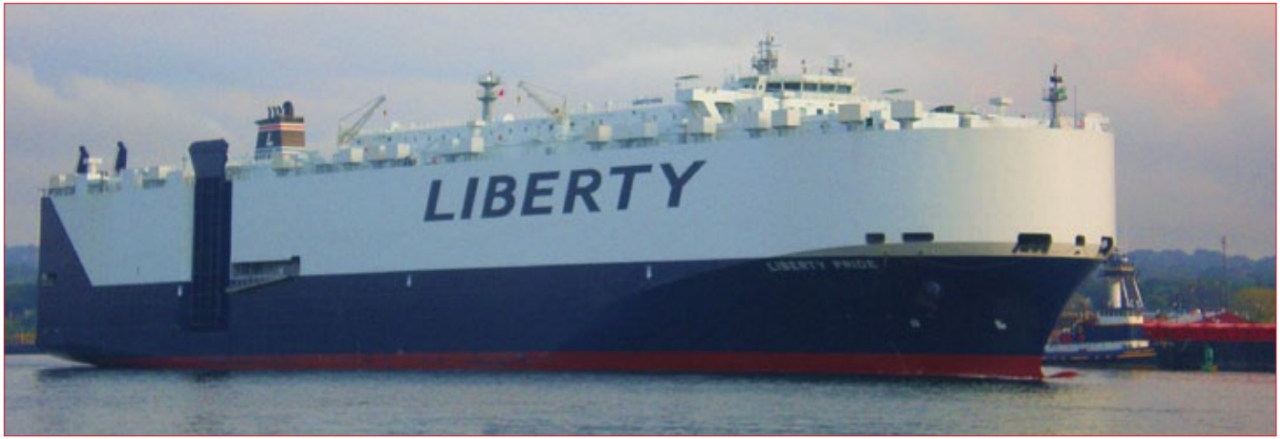
The LIBERTY PRIDE, crewed by expert M.E.B.A. officers from top to bottom, recently made its first of many missions to the Middle East to deliver key military cargo.