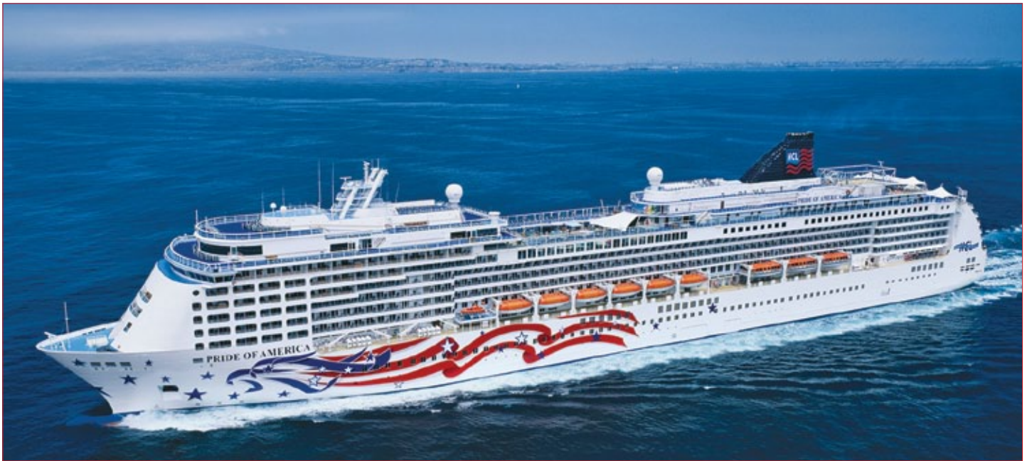
M.E.B.A. recently sewed up a new nine-year contract covering the NCL-A vessel PRIDE OF AMERICA.