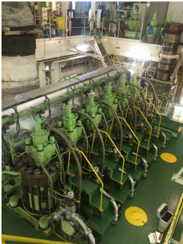
The engine room of the OREGON VOYAGER. M.E.B.A. engineers are familiar with this ship.

Overseas Shipholding Group, Inc. has entered into a 10-year Bareboat Charter Agreement to operate a 1999-built chemical/oil tanker that will supplement the company's Jones Act fleet. They expect to begin operating the former Chevron tanker OREGON VOYAGER in the second quarter of 2019 after redubbing the ship as the OVERSEAS KEY WEST. M.E.B.A. engineers will serve on the ship under our existing contract with OSG when the newly procured vessel goes into service this spring.