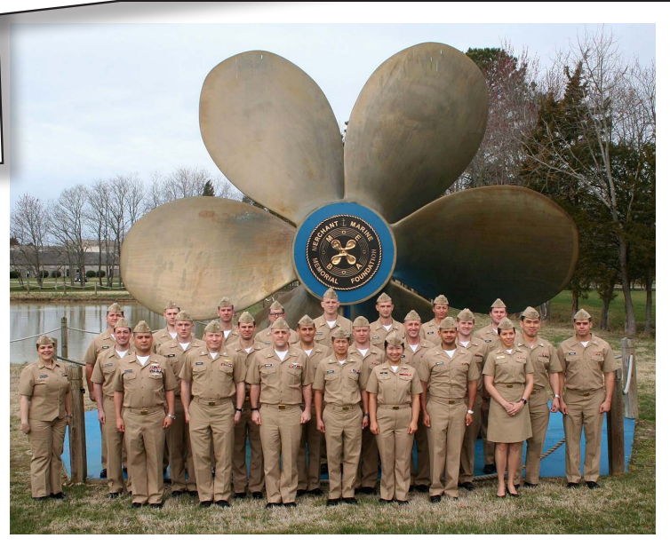
Navy Engineering Duty Officers training at the Calhoon M.E.B.A. School gather at the M.E.B.A. Merchant Marine Memorial to walk the grounds and pay tribute to fallen mariners.