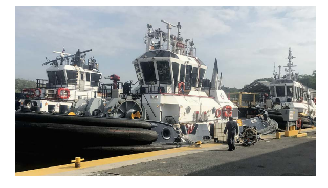
The domain of the M.E.B.A.-affiliated UIM members. On a daily basis, UIM members perform engine room miracles on the tugs that help guide vessels through the Panama Canal.