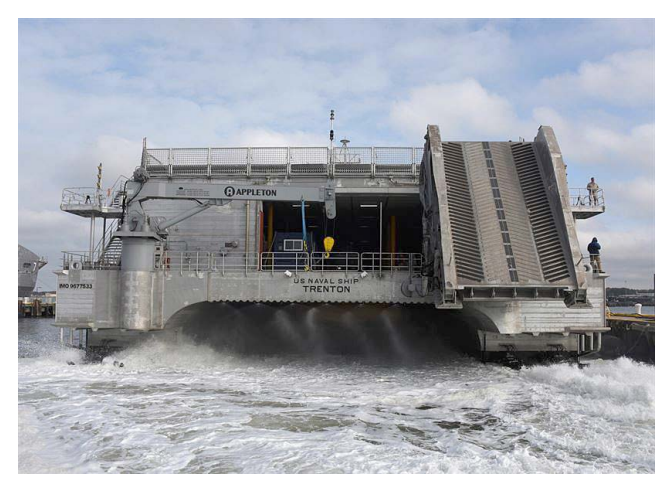
The USNS TRENTON gets underway from Virginia Beach, VA bound for its first forward deployment supporting military operations in the U.S. Navy 6th Fleet.