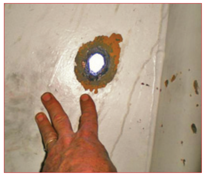
On April 14, the LIBERTY SUN took small arms fire and absorbed several RPG volleys (including this one) in a pirate attack near Somalia. In early May, the M.E.B.A.-crewed MSC ship USNS LEWIS & CLARK was also fired upon by Somali pirates but managed to evade them without taking damage.