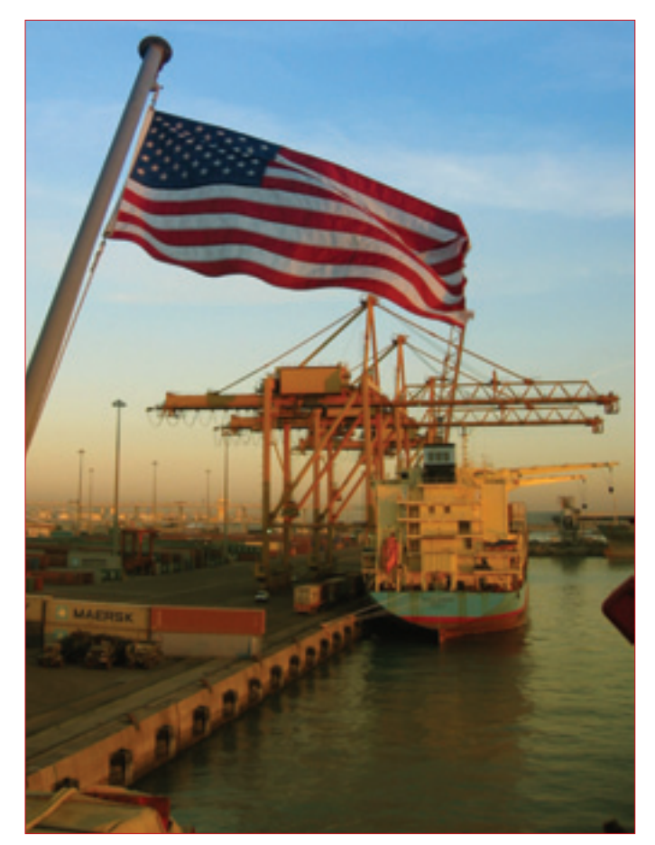
The MAERSK ALABAMA was on a run from Salalah to Djibouti to Mombasa with a load of food aid cargo when four heavily armed pirates attempted to take over the ship.

Though later many in the American media portrayed the incident as the very first attack by pirates against a U.S.-flag ship, many an M.E.B.A. member can describe his or her own close encounter with sea bandits. In fact the MAERSK ALABAMA had been approached by pirates a day before the boarding. The crew had been doing drills which at times could get pretty elaborate under the Captain's leadership. They had